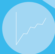
Dives with deco