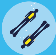
Repetitive dives with no deco