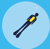
Single Dive with no deco